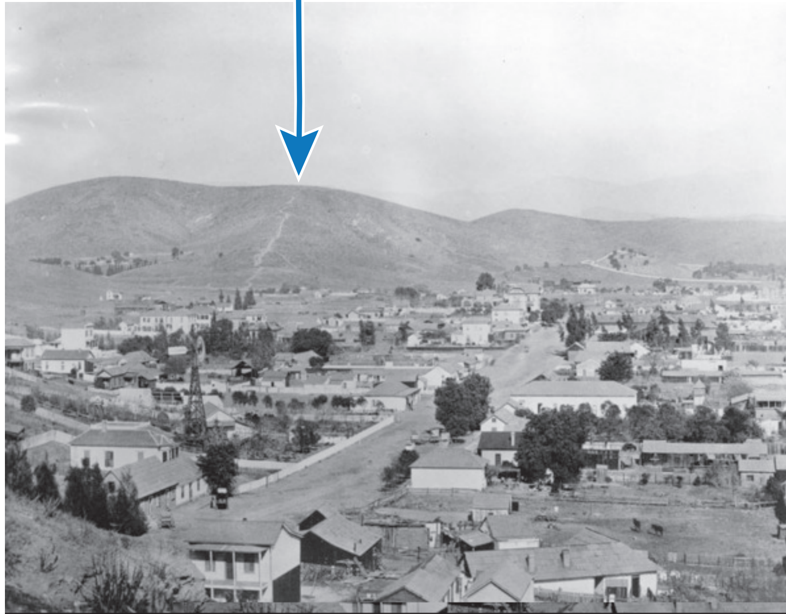
“Imposing Mount Lookout rises above Sonoratown in this circa 1892 photograph. Courtesy of the Photo Collection - Los Angeles Public Library.” from https://www.kcet.org/shows/lost-la/the-view-from-dodger-stadium-in-1877